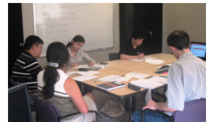
Group workshops are a key resource Directions' clients have access to.

employability strengths, needs and employment and/or training goals. Directions' clients receive great advice in job searching, presentation skills, use of labour market information, and interview preparation. (cont. on next page).